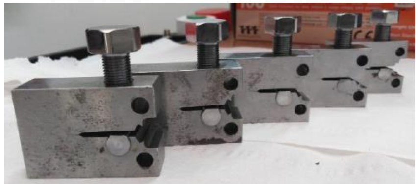
Figure 6: Fracture toughness specimens after exposure

The fractured specimens were also post examined by Scanning Electron Microscopy and the absence of any crack extension due to hydrogen was again verified. As presented in Table 3, the obtained fracture toughness results clearly surpass the qualification criteria of ASME B31.12 Option B ( K_{IH} \geq 55 \text{MPa} \cdot \sqrt{m} ), as well as fulfill ASME code design flaw tolerance criteria. Based on the code, the material can be qualified as suitable for hydrogen service.