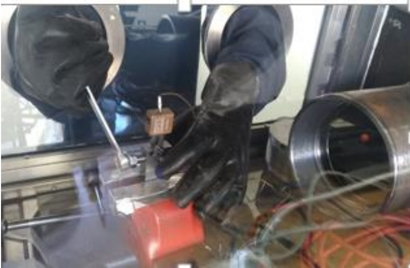
Figure 2: Loading of specimens in autoclave is controlled by high accuracy extensometer