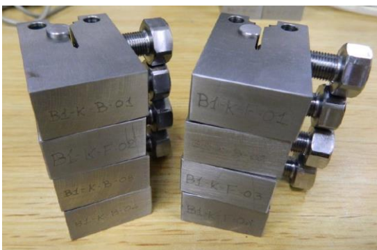
Figure 1: Fracture toughness specimens used in high pressure hydrogen testing

All hydrogen material tests were performed in an acknowledged European research center, specialized to evaluate material and component performance in presence of gaseous hydrogen up to 1000bar external pressure