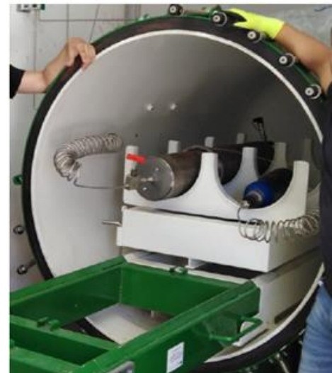
Figure 3: High pressure autoclave in nitrogen security chamber

The determination of the threshold stress intensity factor K_{IH} involves a specimen containing a machined notch (Figure 1). This notch is extended by fatigue cracking and the pre-cracked specimen is loaded by a constant displacement method (bolt) to a stress intensity K_{IAPP} . It should be highlighted that the pre-crack surface during loading should be prevented of contact with atmospheric oxygen and moisture in order not to inhibit hydrogen uptake, therefore application of K_{IAPP} was done in an inert atmosphere glove box. After an exposure period of 1000h (42 days) in room-temperature pressurized hydrogen gas, the specimen is examined to assess whether the initial fatigue crack did or did not grow. In case of no crack growth ( \leq 0.25 mm extension), the minimum qualified K_{IH} is 50% of K_{IAPP} . In case of crack propagation, the propagation length to arrest condition is measured and K_{IH} value is established following the procedure described in ASTM E1681.